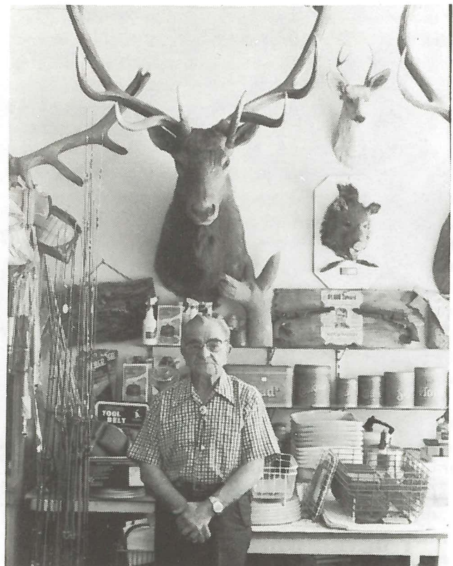
"13th largest elk in the U.S."

"I have quite a few people charging things, and I've been quite fortunate with people around here. But when Stagecoach started, I helped a lot of those fellows get tools, and so many of them left. I got caught holding the sack. I had to just cut down on my credit business. I still have a lot on my books, five to seven thousand dollars."