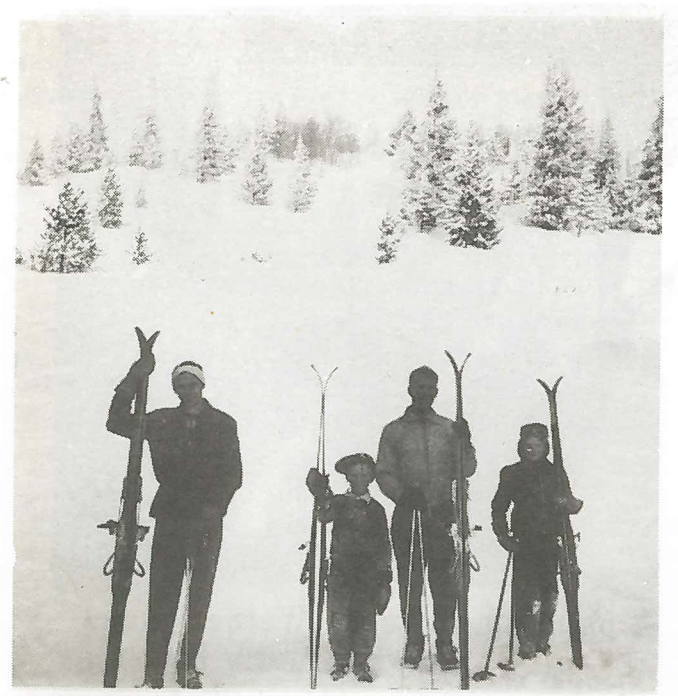
"Look at the length of those skis!"

get supplies. Then we would go out and help them load their panyards, but they always tied up to that tree. It was the funniest looking thing."