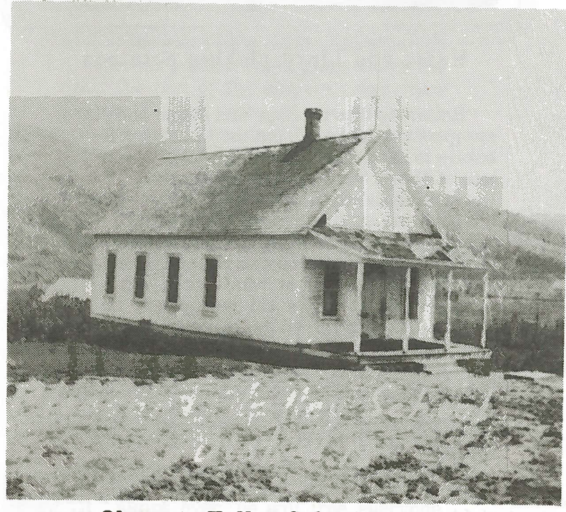
Pleasant Valley Schoolhouse