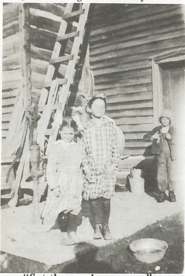
"Got the sun in my eyes."

terrible epidemic. It was in the winter and those people would have pneumonia with it. Of course, in those days the only remedy was mustard plaster, turpentine and lard to take care of people. We tried to feed them, and this one of two different families, all three passed away plus the mother. Sometimes it might be days before the undertaker could get there to get the bodies because he had to come with a team. It was winter and the roads were bad and there wasn't a thing anyone could do. It was a sad thing. Mother went all over the neighborhood helping the sick people and taking a little soup in a quart jar. She would feed them and then come home and get more and go the other way.