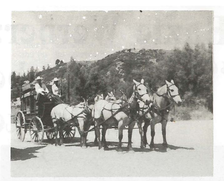
Si Lockhart and the old stage

"Anybody that wanted to come into the country rode the stage. They hauled all the groceries and supplies on the stage. Some of the stages had four horses and some had six horses, maybe even eight, when the spring mud was deep, but most of the time they had four to six. That was when Hahn's Peak was the county seat.