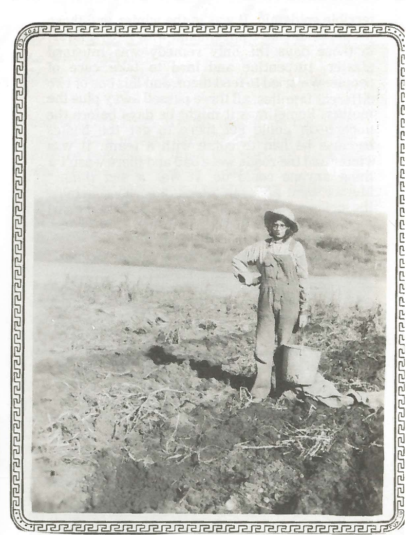
Chores, yes, we had chores!

peddled meat. We would butcher a beef, cut it up and peddle it to the mining towns around. We tried to go every week. We separated the milk and Mama would churn the butter and make cottage cheese. We took all this stuff that we had, butter, beef, hogs and all to sell.